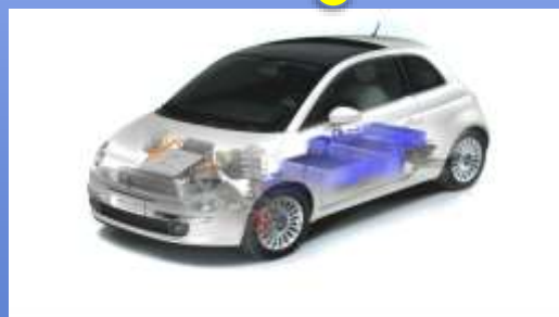
Fiat® 500e - BEV

2008 2009 2010 2011 2012 2013 2014 2015 2016 2017 2018