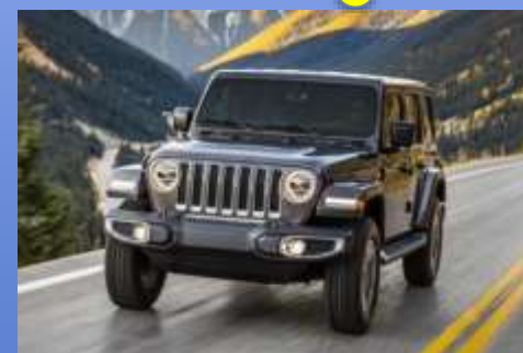
Jeep® Wrangler w/ eTorque -mHEV 2.0L DOHC Turbo