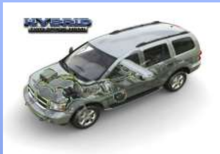
Durango / Aspen - HEV