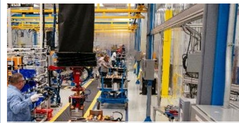
Over 60k packs built to date