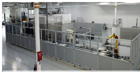
Prototype & pilot build